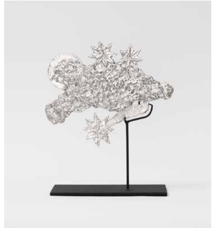
Shooting Star • 2015