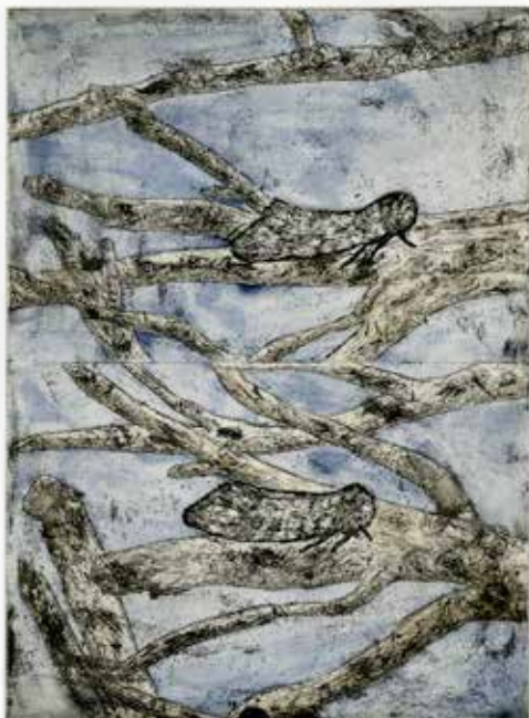
Goat Moth (1 of 6) • 2015