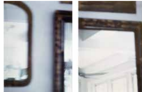
Distracted Mirror 1993

Smith’s transition to a new mode of working is rooted in a keen awareness of the limits and demands of culture. In Paris, she was inescapably an American, and as an American she recognized that the experience of a foreign culture, no matter how familiar, is ultimately mediated through the organs of that culture, which distill centuries of complexity and conflict — as manifested in its art, design, history, customs, and cuisine — into a comprehensible narrative.