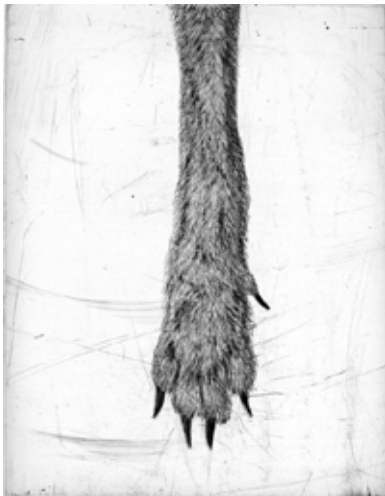
Jewel • 2004