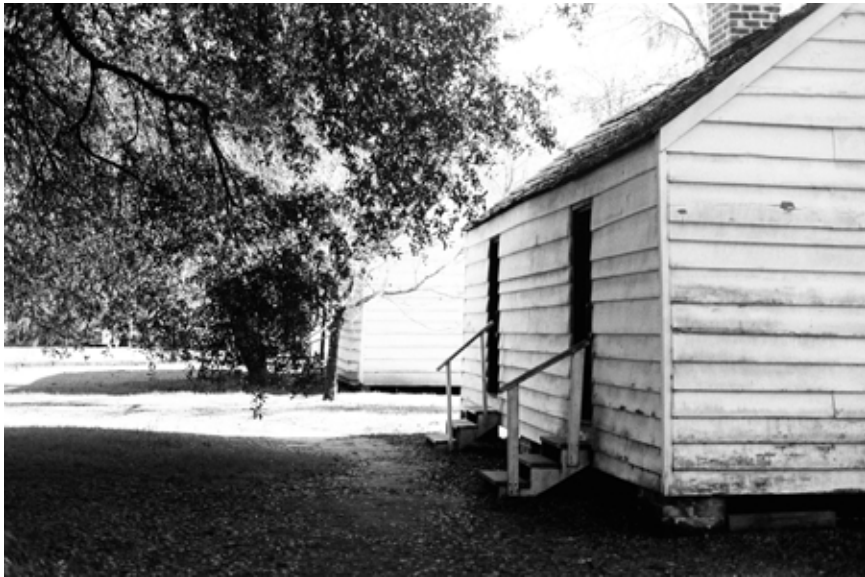
Savannah/Charleston, Slave House #17 • 2015