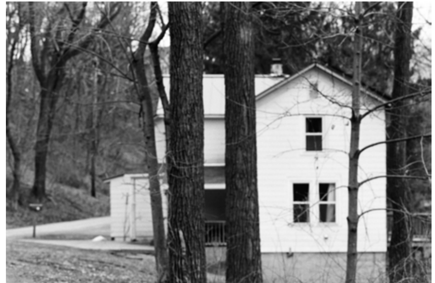
Two Trees Before House, Leeds Series • 2012

1 Aschheim, Eve. "In Conversation: Seton Smith with Eve Aschheim." The Brooklyn Rail (February 2008). Interview.