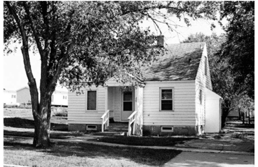
North Dakota Houses #5 • 2014