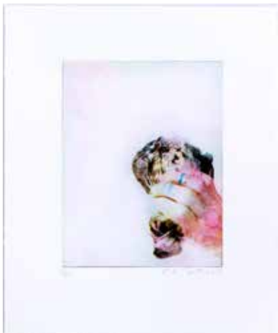
(Clockwise from top left) Earth, Sea, Sky • 2015