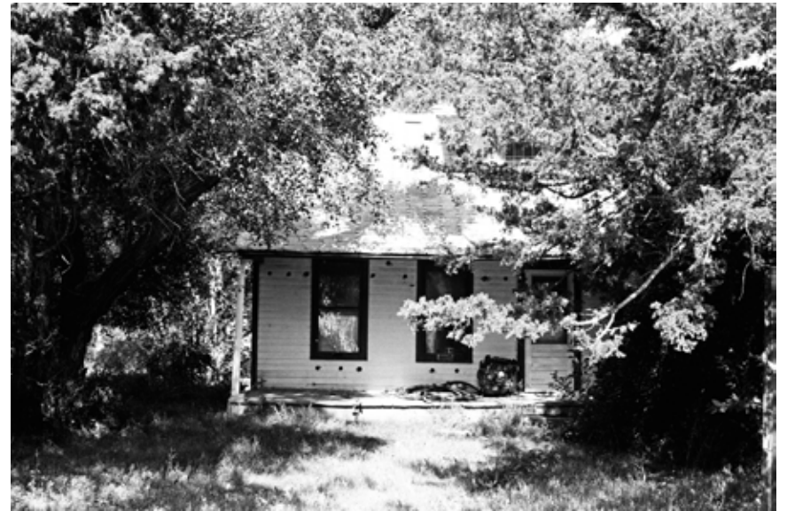
North Dakota Houses #15 • 2014