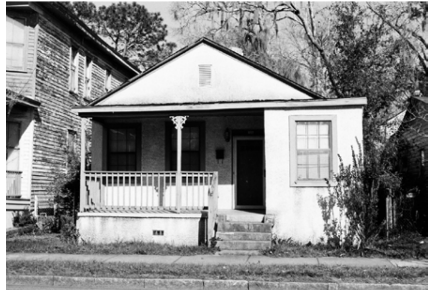
Savannah/Charleston #15 • 2015