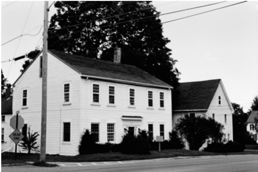
Tim's House, Maine Series • 2013