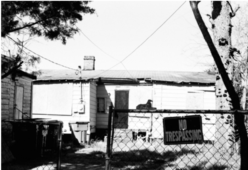
Savannah/Charleston #11 • 2015