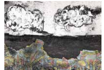
Seven Seas (1 of 7) 2012

There are no boundaries to the kinds of materials she uses — wax, bronze, plaster, glass, polyester resin, fiberglass, paper, pewter, neon light, photography, collage — nor are there limits to the range of emotions she is willing to explore. Her imagery confronts the viewer with the dislocating, psychic shock espoused by the Surrealists, summed up in the famous phrase from