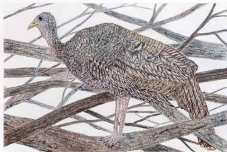
In a Bower • 2015